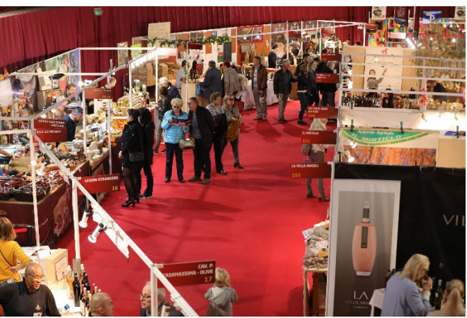
Stand type at IOA24, Nice, 2019